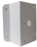
DS-1276ZJ Corner Mounting Bracket