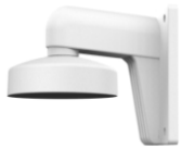
DS-1272ZJ-110-TRS Wall Mounting Bracket